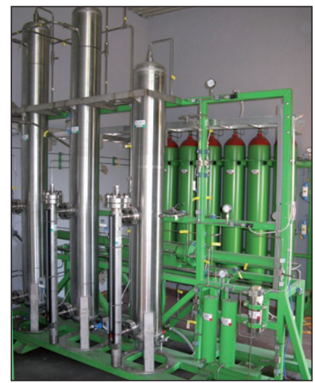
Figure 1. The patented Metener biogas upgrading technology (Jussi Läntelä, Metener Ltd.)

Kalmari farm is one of the pioneer farms producing biogas in Finland, and an excellent example of innovative use of biogas technology. The farm is self-sufficient in electricity, heat and vehicle fuel. Excess electricity is sold to the grid, and vehicle fuel sales exceeded 1000 MWh in 2011. The biogas plant digests cow manure and confectionery by-products, and in the future will also digest fat trap waste and liquid biowaste (under the EU animal by-products regulation). Occasionally smaller amounts of energy crops, mainly grass silage, are digested as well. Digestate is used as bio-fertilizer on the farm's own fields. Biogas technology on the Kalmari farm thus efficiently combines energy production, waste treatment and nutrient recycling.