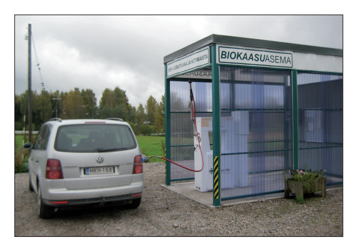
Figure 3. New biomethane filling station on Kalmari farm (Outi Pakarinen).