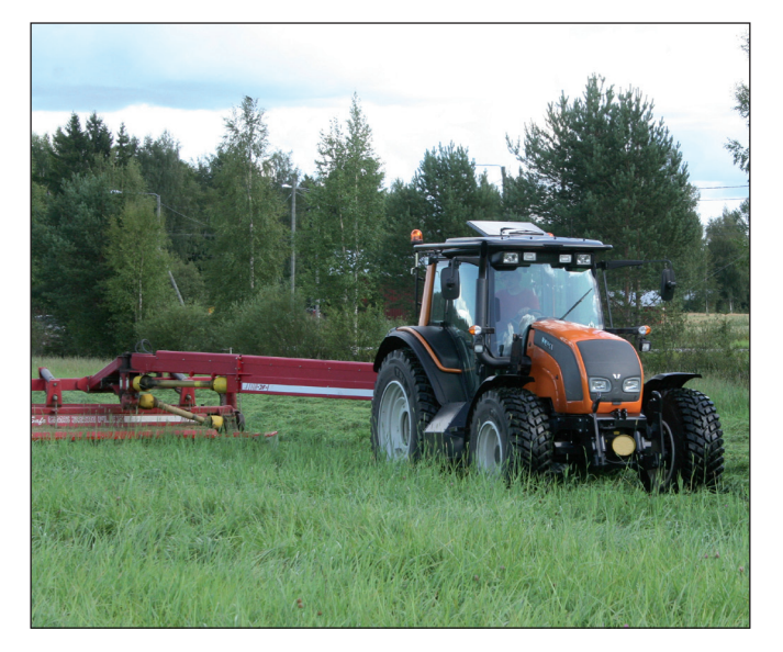
Figure 4. Valtra dual-fuel biogas tractor in test use on the Kalmari farm (Metener Ltd.)